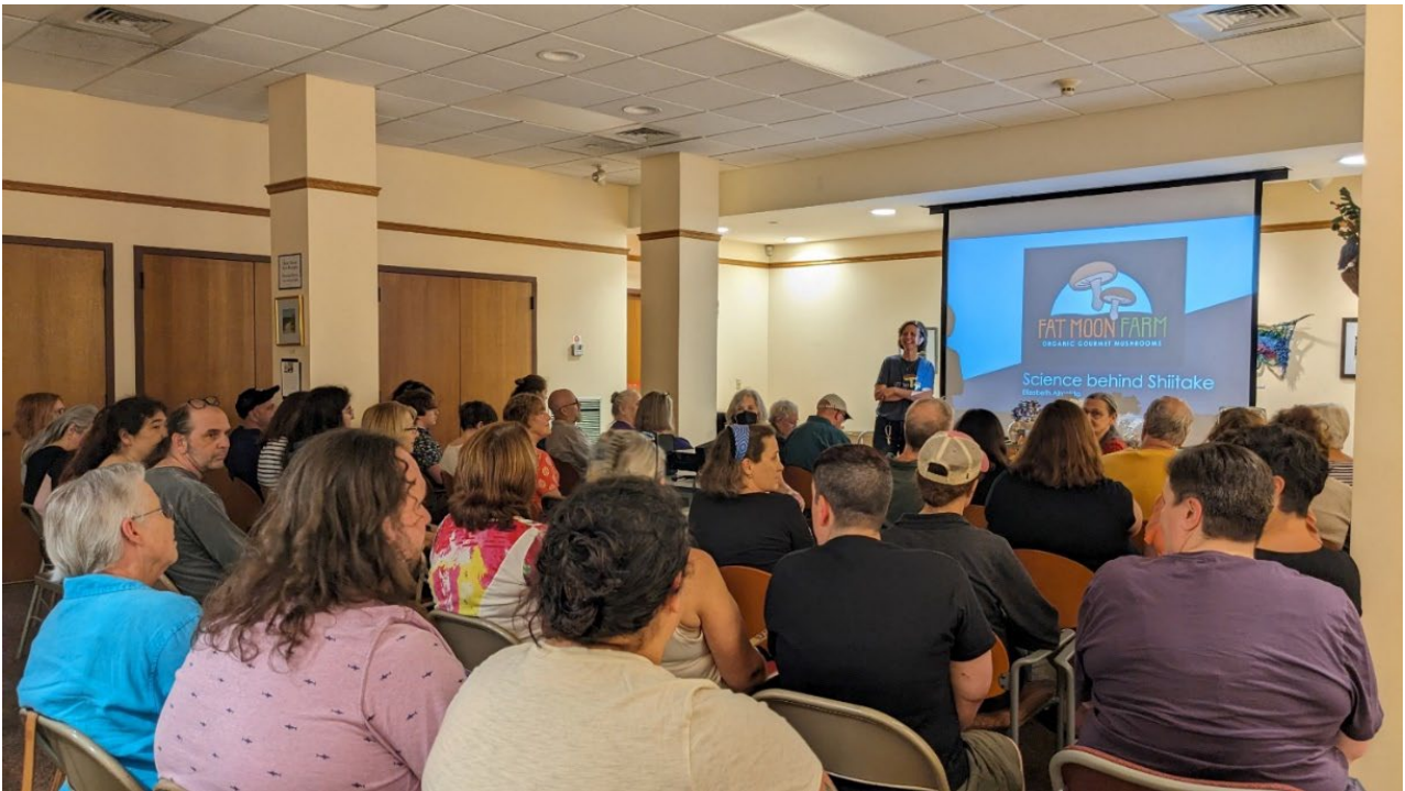
Packed crowd for growing your own mushrooms in Sibley Hall on Sept. 14, 2023