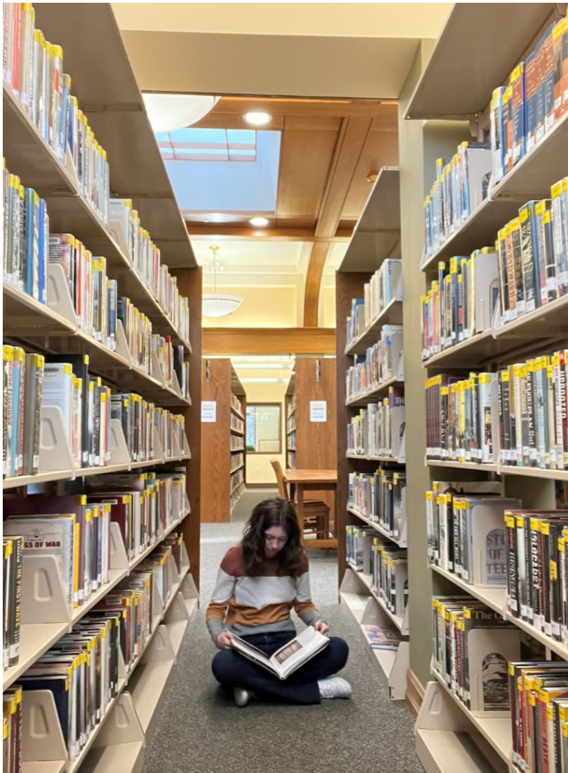
Reading in the stacks