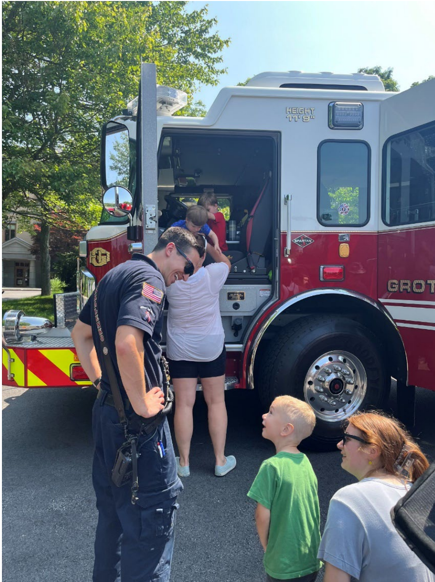
Touch-a-Truck event at the library, July 6, 2023