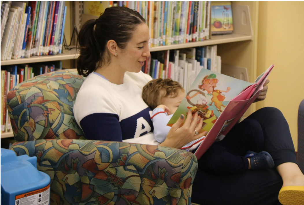
Snuggling in the children's room, 2023