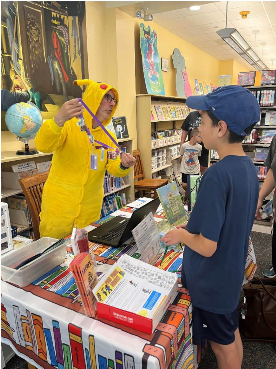
"Pikachu" signing up kids for summer reading in the Children's Room during FanFest, June 23, 2023