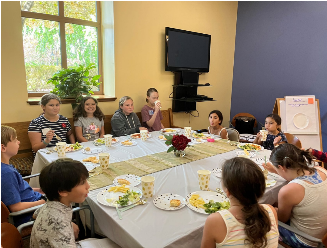
Learning table manners at etiquette camp, July 26, 2023