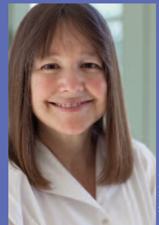
Author Anne Fadiman

Mark your calendar for author Anne Fadiman's visit, Sunday, February 20, 2011.